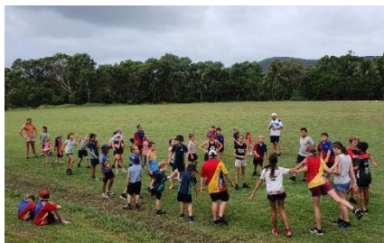
Photo: The older athletes leading the young ones through a warm up.

Well done to all of those involved in re-establishing Cooktown Little Athletics.