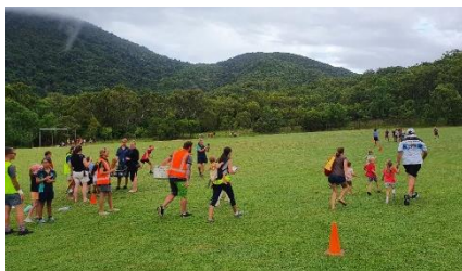
Photo: The first event of the re-established Cooktown Little Athletics Centre.